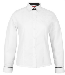
Long Sleeve Blouse