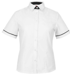
Short Sleeve Blouse